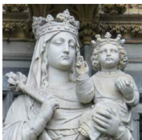
Semiramis with her son, Tammuz. Conceived by Nimrod, the sun god.

As mentioned earlier, there is a call to God’s people at the end of time, and that call is mentioned in Revelation 14 when distinguishing between true and false worship.